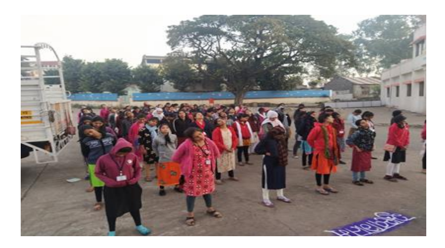
Drama - Mahapralay Antacha Aarambh

Drama activity which was held on "Mahaprlay: Anatacha Aramba "conducted by NSS unit of BVCOEW. This activity was held with enthusiasm students participated in this Drama. Students made posters, slogan and made awareness among everyone. In this drama they showed how small things lead to big disaster. Villagers and students actively involved in this activity.