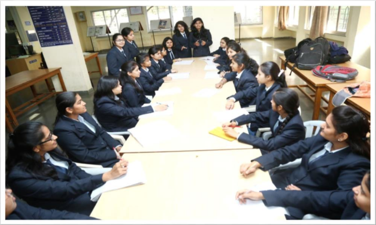
Library Reading Hall