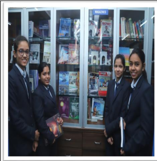
Journals / Periodicals Section