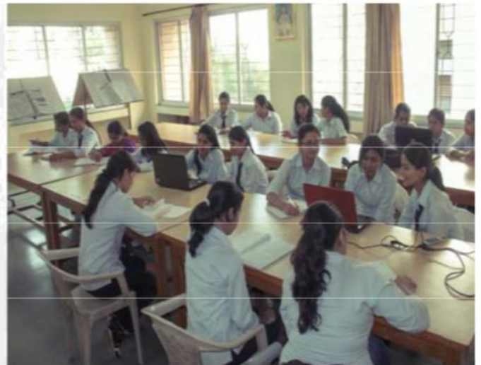
Library Reading Hall