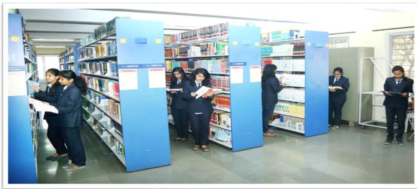
Library Book Shelves