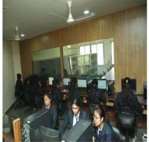
Digital Library & Reference Section