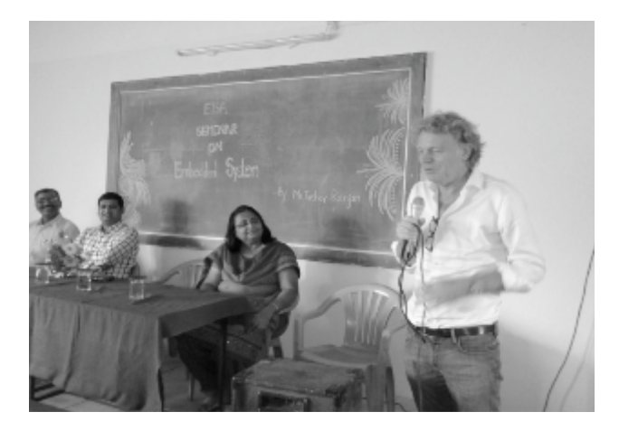
Expert Lecture on Embedded System