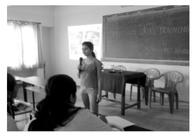
Workshop Conducted by Sony Erricson