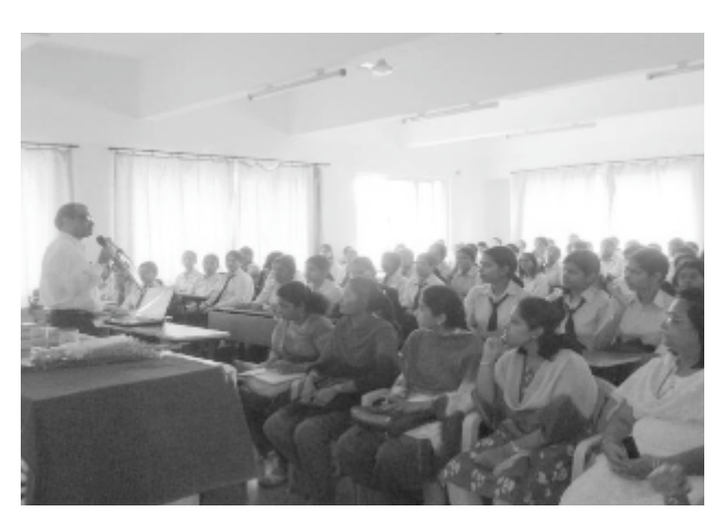
IEI Paper Presentation