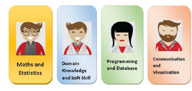
Fig 2. Skill Set

By definition, Data Scientist is an analytical professional who is responsible for collecting, analyzing and interpreting data to help drive decision-making in an organization. He/she can build machine learning models, scale the efforts at large level, leverage the software engineering skills and common programming languages such as R and Python to optimize a program or to conduct more statistical inference and data visualization.