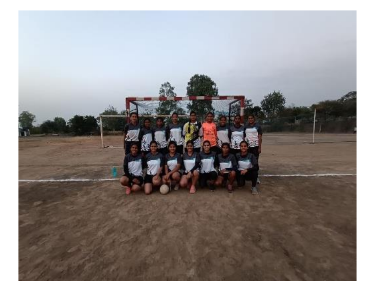
West Zone Basketball Competition (Shri Vaishnav Vidyapeeth Vishwavidyalaya, Indore (MP)) 6<sup>th</sup> to 11<sup>th</sup> November 2022