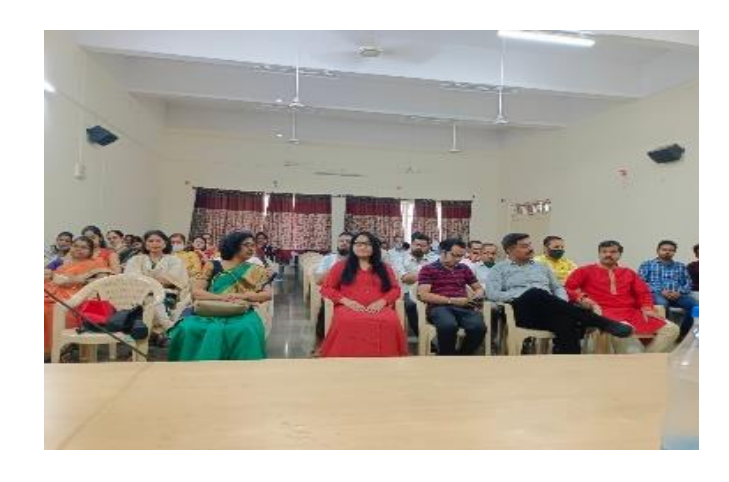
International Yoga Day – 21/06/2022