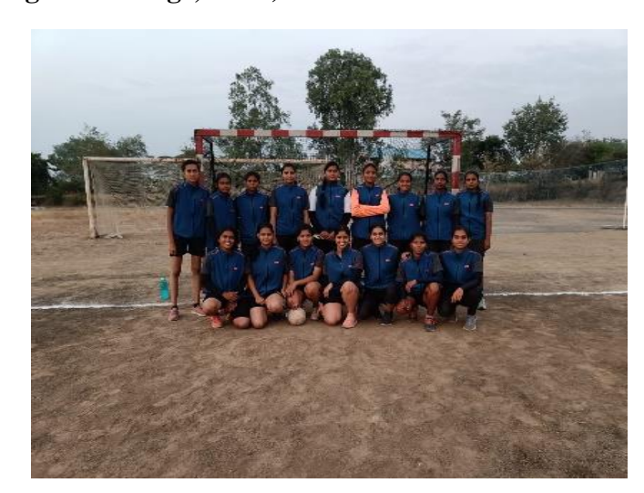
Cricket\ 22 - 23/11/2022\ (S.P.College)