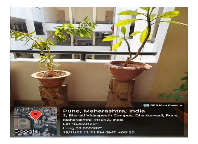
Tree plantation in clay pots and refraining from using plastic pots