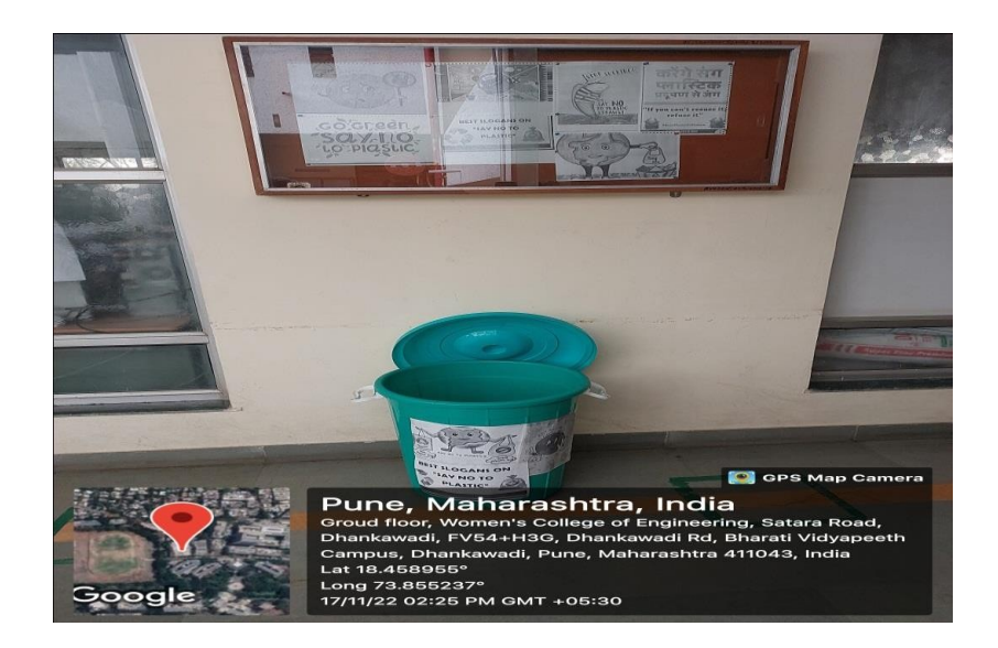
Bins are placed to collect plastic waste