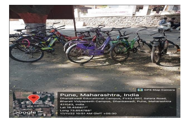
Students and Faculty using Bicycles in Campus