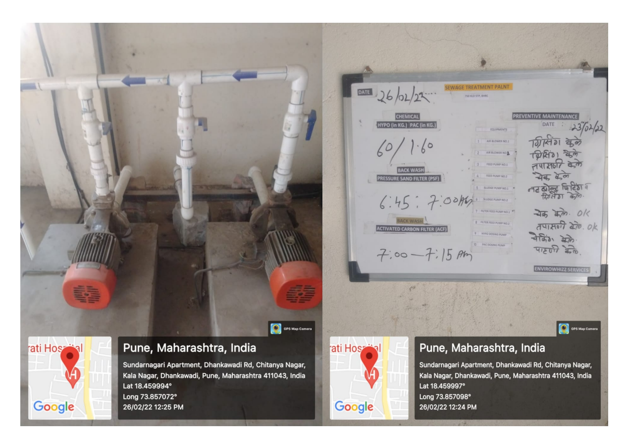
Sewage Treatment Plant (STP)

1) LIQUID WASTE MANAGEMENT: The institute along with all other institutes in the campus of Bharati Vidyapeeth's Dhankawadi campus shares a centralized Sewage Treatment Plant (STP) of having a capacity of 750 m<sup>3</sup> per day. The total sewage collected from bathrooms and toilets is treated in the Sewage Treatment Plant based on high efficiency modified aerobic activated sludge system using extended aeration process. The treated sewage meets the requirements of the State Pollution Control Board and the same can be used for landscaping and other purposes.