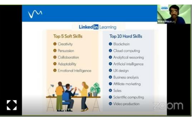
SE,TE,BE Webinar on "Power up resume with IBM skillbuild certificates" by Mr.Harshad (WordsMaya, Pune) on 5<sup>th</sup> October2020 .