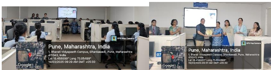
Seminar on IPR Commercialization