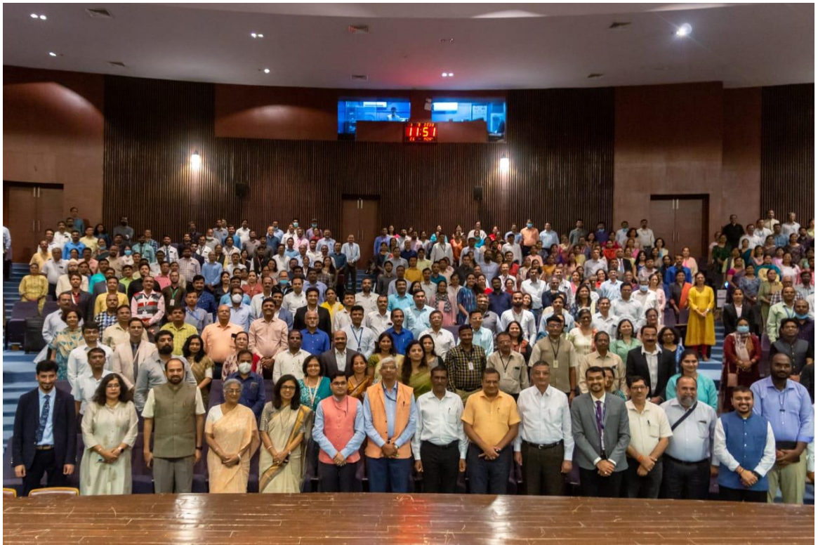
First IIC regional meet at Smbiosis University